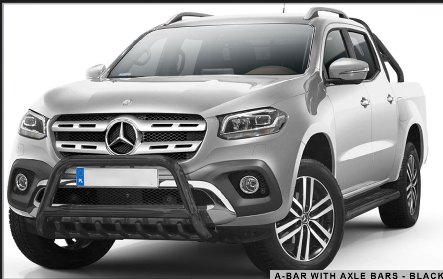
A-BAR WITH AXLE BARS - BLACK

The bars are crash tested on each individual vehicle for safety monitoring. All of the required instructions are included with the bar giving you detailed steps on how to attach the bar directly onto your vehicle. Alongside this all of the required bolts are included with the bar, making the whole installation process quick and easy.