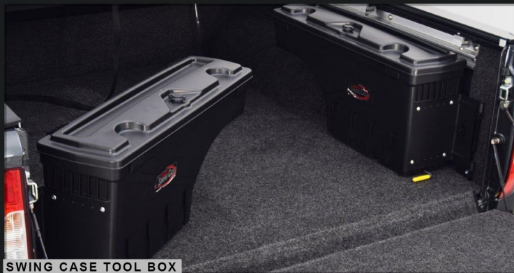
SWING CASE TOOL BOX