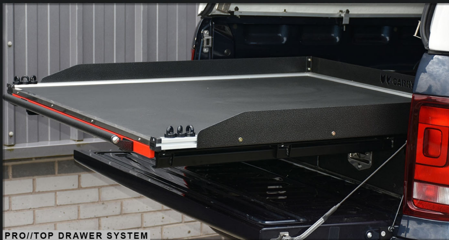
PRO//TOP DRAWER SYSTEM