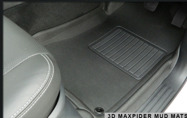
3D MAXPIDER MUD MATS