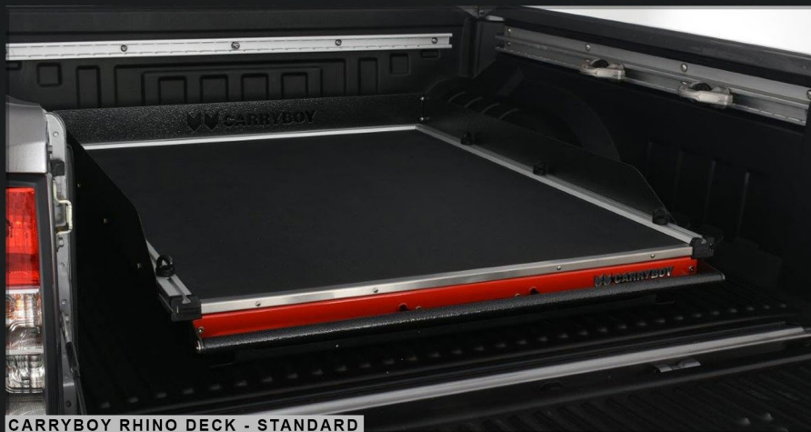
CARRYBOY RHINO DECK - STANDARD