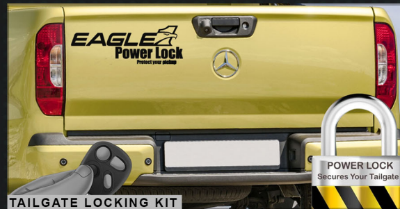
TAILGATE LOCKING KIT

The simple design affords for added security and flexibility, you can lock or unlock you tailgate using your key fob or using your key. The Power Lock converts your tailgate into central locking working in conjunction with your existing vehicle central locking