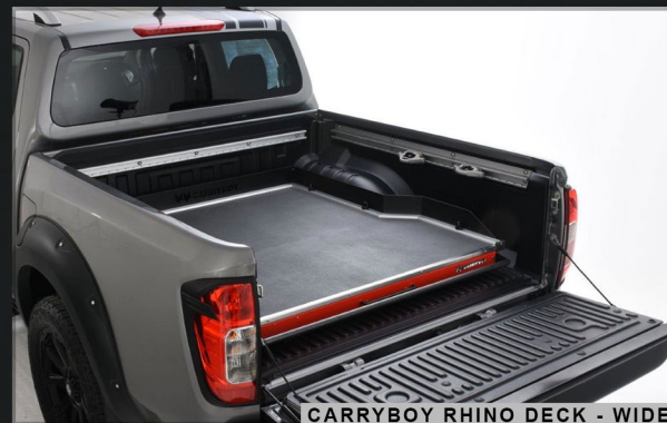
CARRYBOY RHINO DECK - WIDE