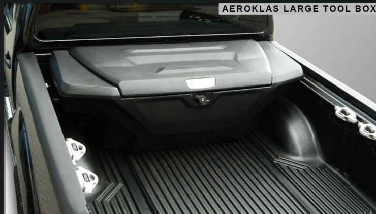
AEROKLAS LARGE TOOL BOX