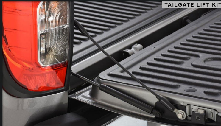
TAILGATE LIFT KIT