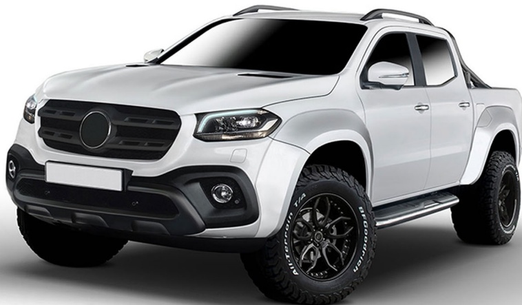
EXTREME WHEEL ARCHES IN PRIMER

For those X-Class clients looking to individualise their Mercedes-Benz we offer you our Extreme wheel arch body kit. Supplied in a ready to paint primer finish, the X-Class wheel arches are a non-drill fitment but require body shop installation.