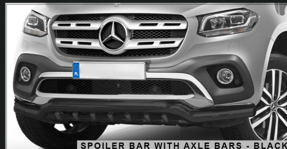
SPOILER BAR WITH AXLE BARS - BLACK

The Steeler branded black front bars have a 70mm diameter tube size and a thickness of 2mm