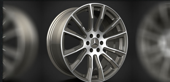
HAWKE DENALI WHEEL GREY

These great looking 20x9 inch alloy wheels are designed specifically to fit the Mercedes-Benz X-Class. These wheels will add an aggressive and individual look to your X-Class. The concave styling is combined with multiple spokes to form the most exquisite upgrade wheel.