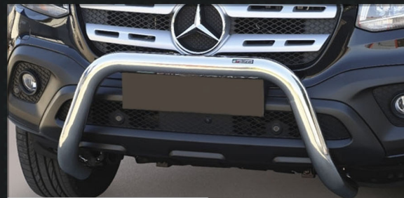
A-BAR - STAINLESS STEEL

Fashioned from high quality stainless steel, this front protection bar is a great accessory for your X-Class. Not only does the bar shield the integral components of the engine it also gives the vehicle a sturdier appearance that makes it stand out from the crowd.