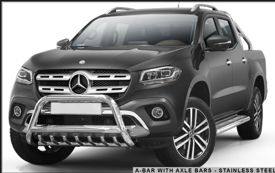
A-BAR WITH AXLE BARS - STAINLESS STEEL

The Steelers front protection bar safeguards your X-Class from a number of different conditions. Often referred to as Nudge Bars, or Bull bars, the Steeler branded stainless steel front bar has a 70mm diameter tube size and a thickness of 2mm. All of the required instructions are included with the bar giving you detailed steps.