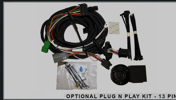
OPTIONAL PLUG N PLAY KIT - 13 PIN