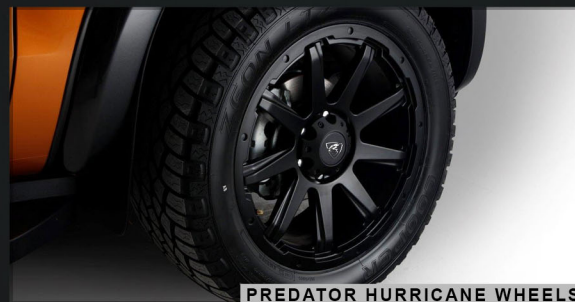
PREDATOR HURRICANE WHEELS

These alloy wheels will give you improved grip and road holding, maximising the usability and functionality