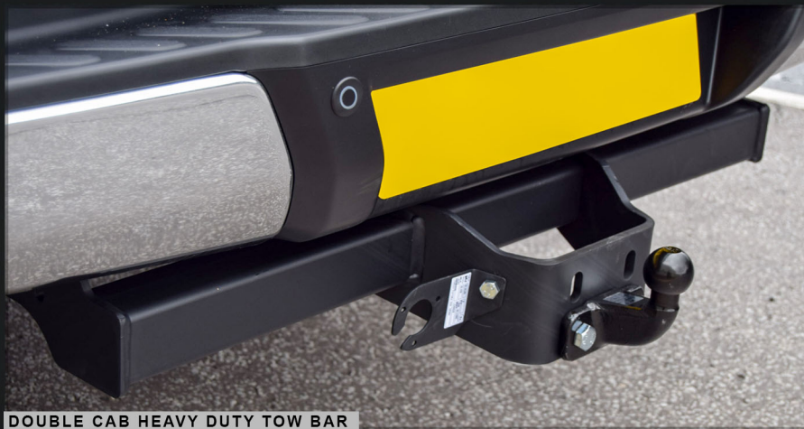
DOUBLE CAB HEAVY DUTY TOW BAR