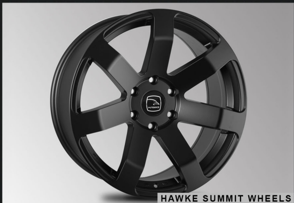
HAWKE SUMMIT WHEELS

Tyres suitable for this wheel: 285x50x20 and 275x55x20