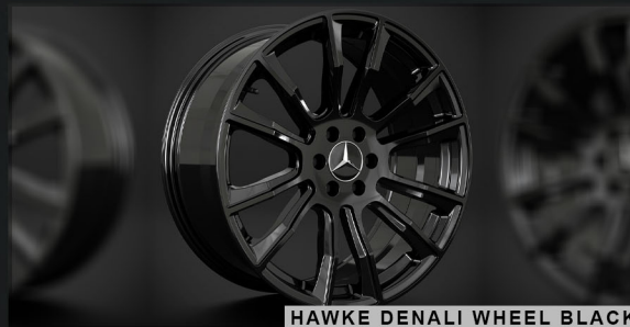
HAWKE DENALI WHEEL BLACK