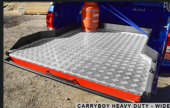
CARRYBOY HEAVY DUTY - WIDE