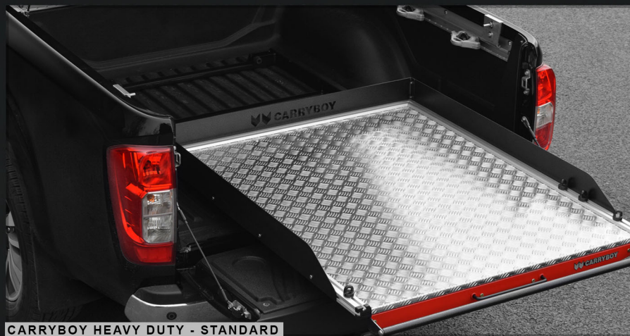
CARRYBOY HEAVY DUTY - STANDARD