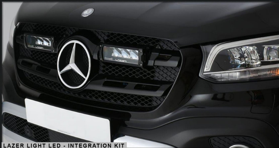
LAZER LIGHT LED - INTEGRATION KIT