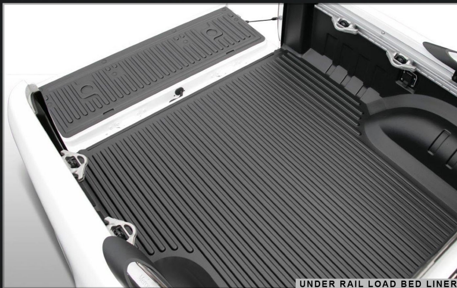
UNDER RAIL LOAD BED LINER

Proform bedliners are manufactured from a highly durable, chemical resistant and UV stable Polyethylene type plastic. The Bed liners are designed to handle the toughest conditions and protect your pickup truck bed from impacts, scratching & spills in all environments. This load bed liner comes with a life-time warranty.