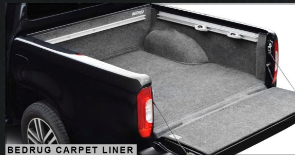
BEDRUG CARPET LINER

Bedrug is a great alternative to the basic hard plastic bed liner offering a more luxurious look and feel while retaining the same protective properties as a rigid plastic liner. Bedrug has an anti-skid surface which prevents cargo from sliding around in the boot.