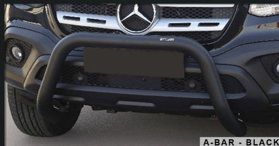
A-BAR - BLACK

The bars are also EU approved meaning that they can be attached to your vehicle and still be used on roads.