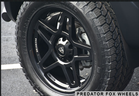
PREDATOR FOX WHEELS

Made by low pressure casting in a TUV environment to JWL standards. This means that you are getting the highest possible quality from a wheel.