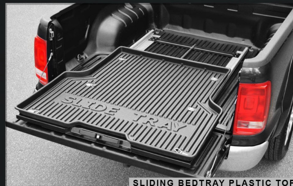
SLIDING BEDTRAY PLASTIC TOP