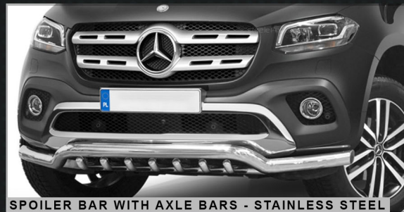
SPOILER BAR WITH AXLE BARS - STAINLESS STEEL

The Steelers front protection bar safeguards your X-Class from a number of different conditions as well as giving it a unique look. The bars are crash tested on each individual vehicle for safety monitoring.