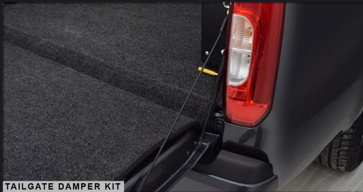
TAILGATE DAMPER KIT