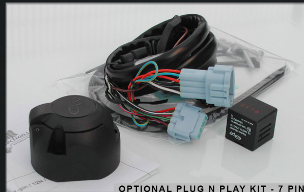
OPTIONAL PLUG N PLAY KIT - 7 PIN